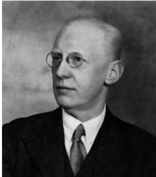
Joseph Proudman, first Director of the amalgamated Observatory and Tidal Institute

Naturally the expertise built up at Bidston became invaluable during the Second World War. It was vital to be able to predict tides for the many theatres of war, such as Burma and the D-Day landings. One of the tide-predicting machines was placed in a separate semi-underground room in the observatory grounds. Indeed the door to this room suffered blast damage from a bomb and the Observatory building itself lost a hundred panes of glass as well as suffering damage to doors, interior walls and ceilings in six different incidents. Remains of some of the necessary building reinforcements can still be seen. The scientific work itself was speeded up so that predictions were advanced by a year and they were photographically recorded against loss – a