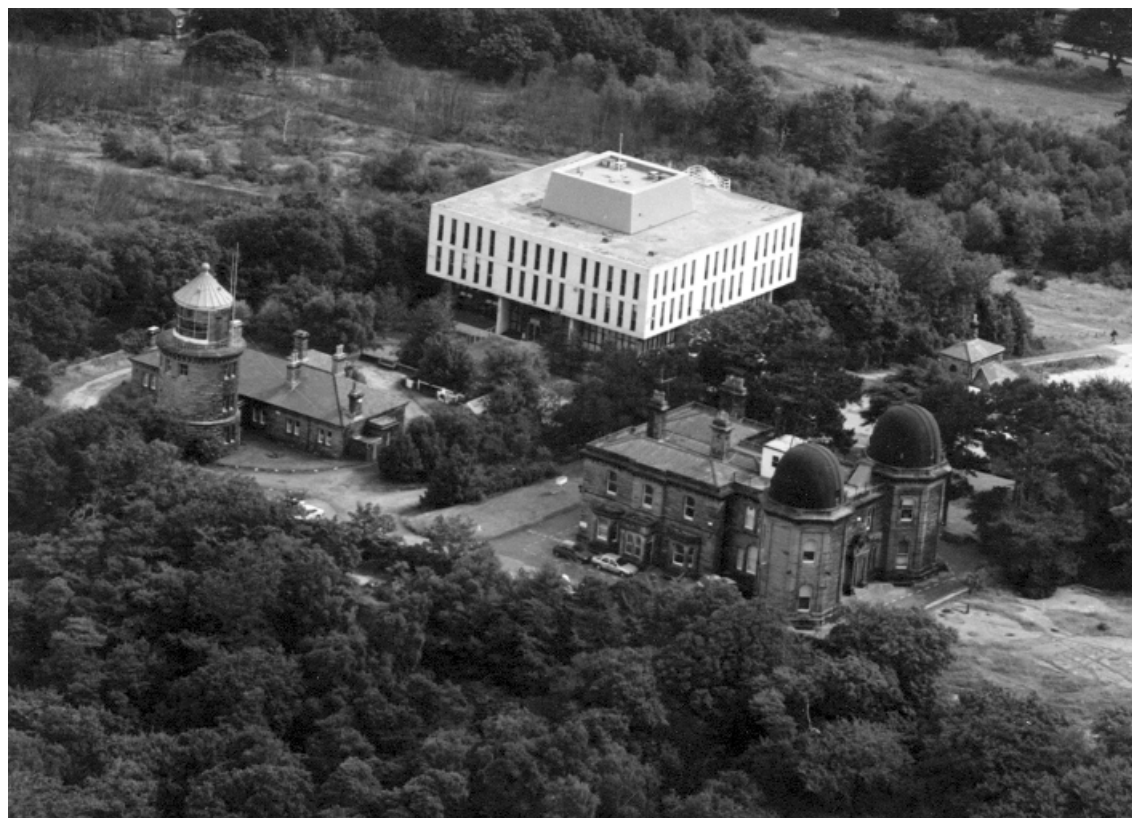
The Proudman Oceanographic Laboratory photographed from the air in 1986, when the domes (lower right) were still painted black